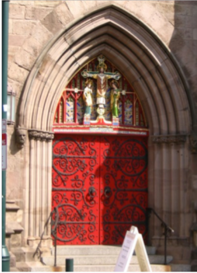
Red Door Cabaret at Holy Trinity Episcopal Church