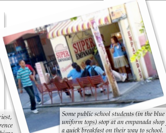
Some public school students (in the blue uniform tops) stop at an empanada shop for a quick breakfast on their way to school.